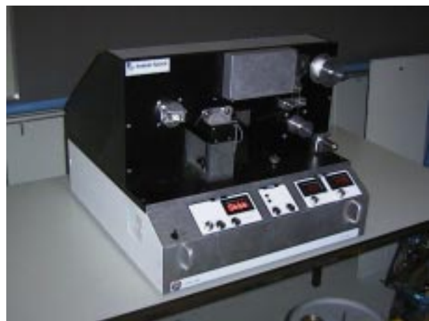
Figure 5. Coiling machine for applying tensioned Dyneema wire around Reel parts