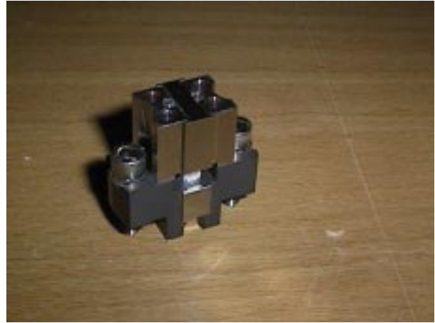
Figure 3. Reel; consumable part of the MHRM

The wire bundle that keeps the Reel parts clamped together consists of a single Dyneema wire that has been coiled around the parts approximately 140 times under preload using a dedicated coiling machine (see figure 5).