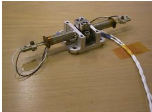
Figure 1. MHRM Engineering Model