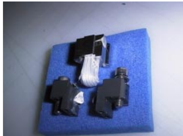
Figure 6. Reel after ultimate strength testing; fractured lower Reel part and still intact wire bundle and upper Reel part

3 Reels were proofloaded after exposing them to 50 °C for 12 hours; the clamp load appeared to have decreased to 4 kN. This shows that the creep limit of Dyneema is temperature dependent.