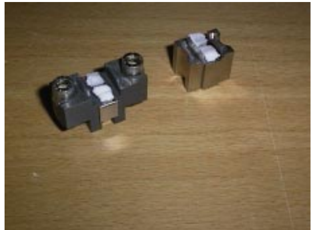
Figure 4. Upper and lower Reel parts after cutting