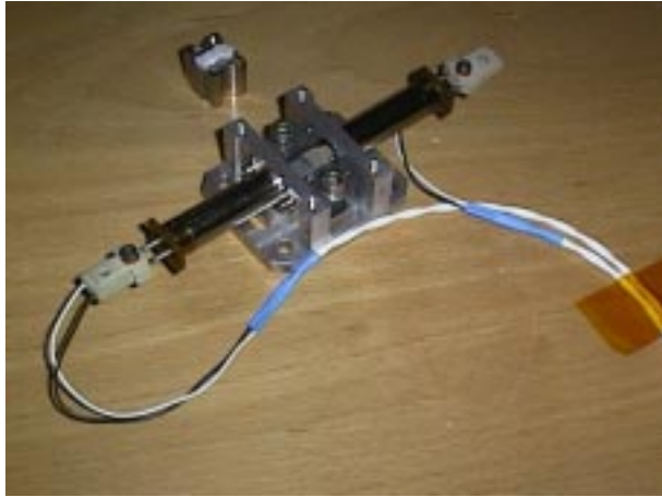
Figure 2. MHRM and released upper Reel part

The dimensions of the Engineering Model are 38 (height) by 50 by 250 mm, including Thermal Knives and electrical wiring.